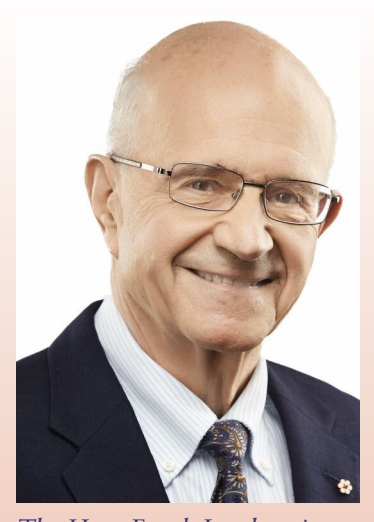
The Hon. Frank Iacobucci

Visiting Bullock Chair the Honourable Frank Iacobucci reflects on his visit to Israel